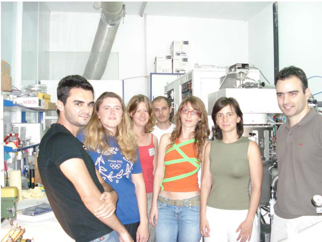
During the lab : Fabrication of plastic microfluidic devices by lithography and deep polymer plasma etching techniques.