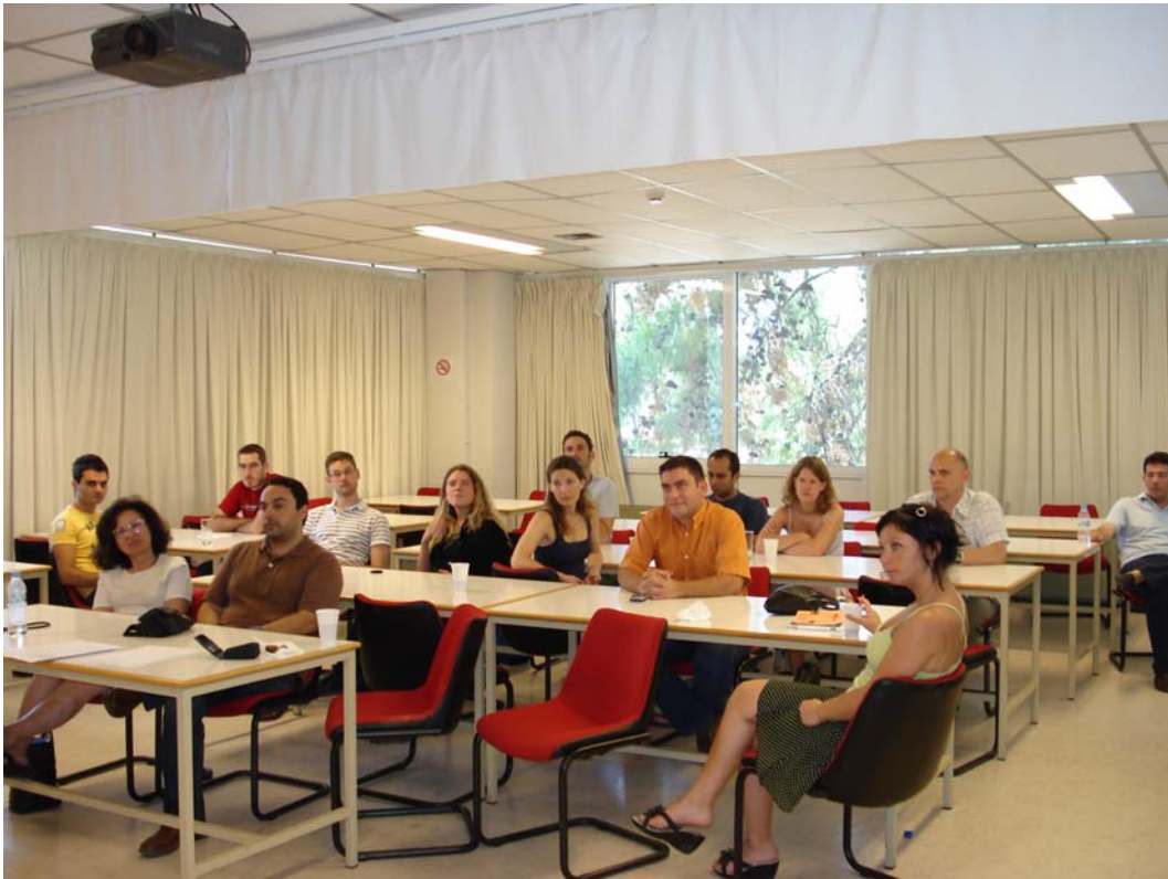
In the classroom for the certificate award