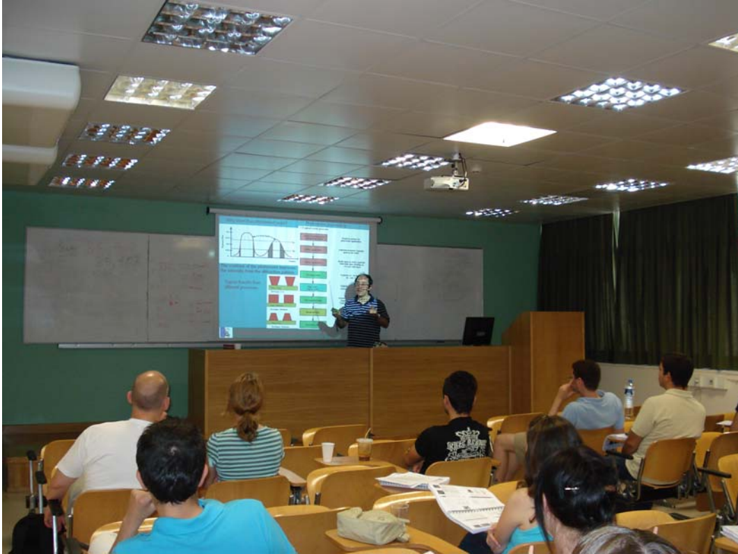
In the lecture hall