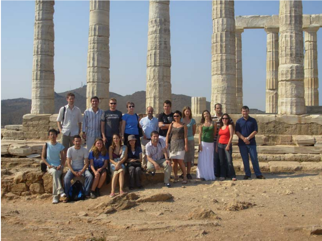
Excursion to Sounion