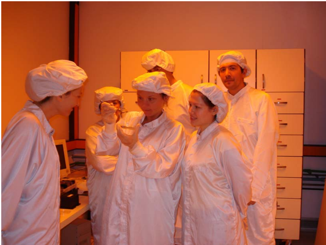
During the lab : Fabrication of microfluidic devices on plastic substrates by lithographic techniques